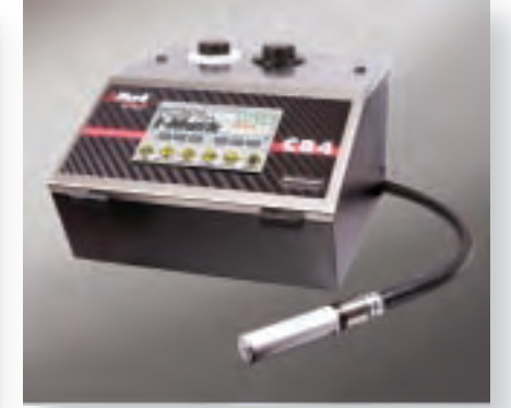
Continuous Ink-Jet (CIJ)