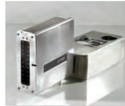
High Resolution (Hi-Res)